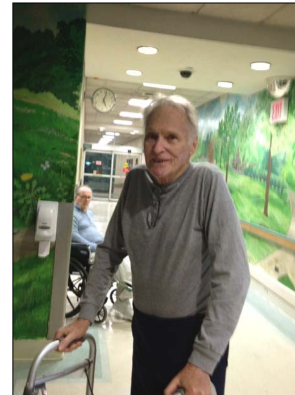
Del's on the Move!