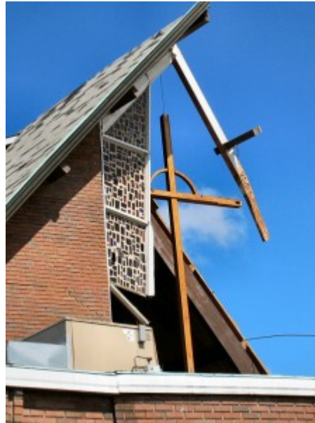
Covenant Presbyterian Church "A glancing blow..." Tuscaloosa, Alabama – 3 days ago

"The fishermen know that the sea is dangerous and the storm terrible, but they have never found these dangers sufficient reason for remaining ashore."